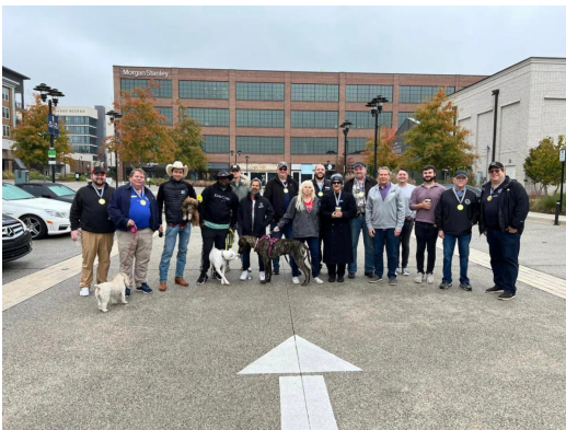
Peachtree Members supporting the Atlanta Chapter of Alzheimers at Cars and Coffee

The CEO of the Atlanta Chapter was there to greet members as they supported such a worthy cause.