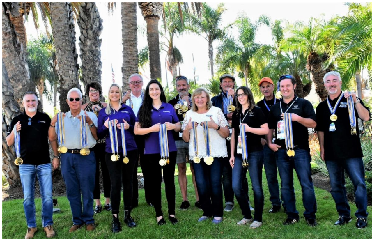
Presentation of medallions to Alzheimer's Representatives in center wearing purple shirts.