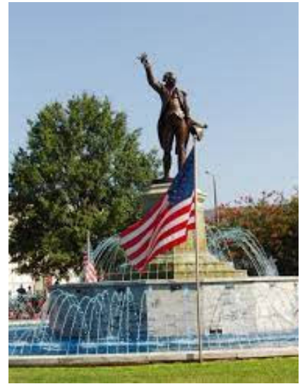
French and American hero General Marquis de Lafayette

Our Return Trip will take back roads towards Luthersville and eventually onto I85 north toward Atlanta where everyone can disperse to head home.