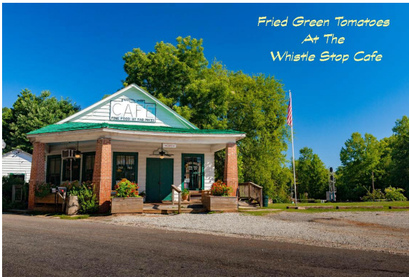
Fried Green Tomatoes At The Whistle Stop Cafe