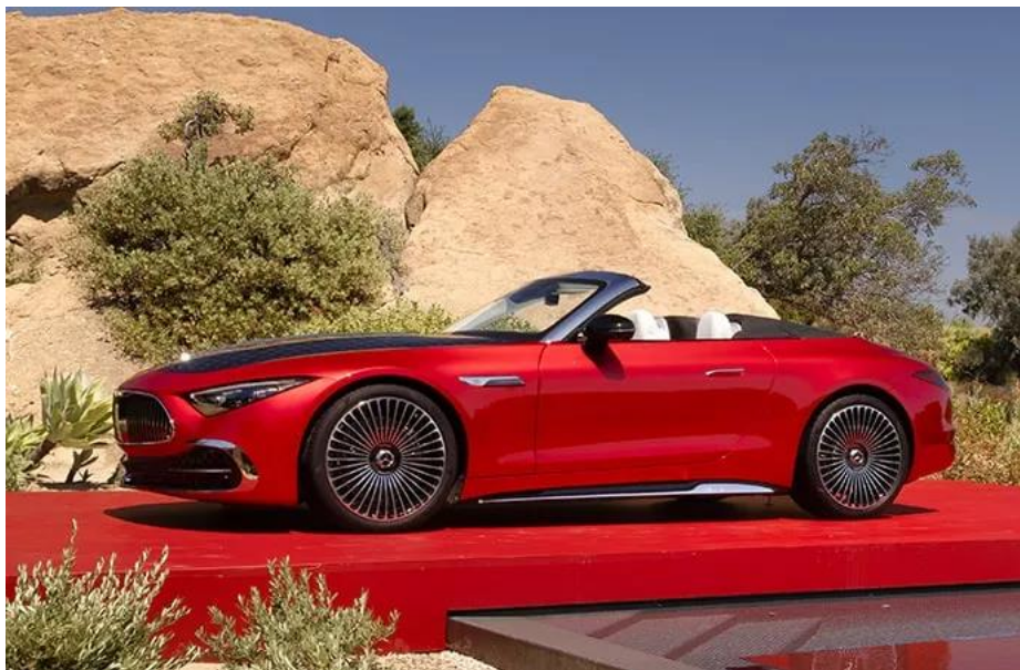
Mercedes-Maybach SL 680

Thank you all for your sustained membership and support of the club!