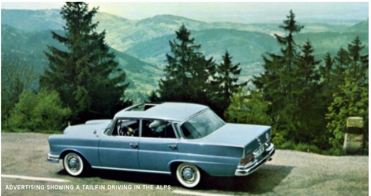
ADVERTISING SHOWING A TAILFIN DRIVING IN THE ALPS