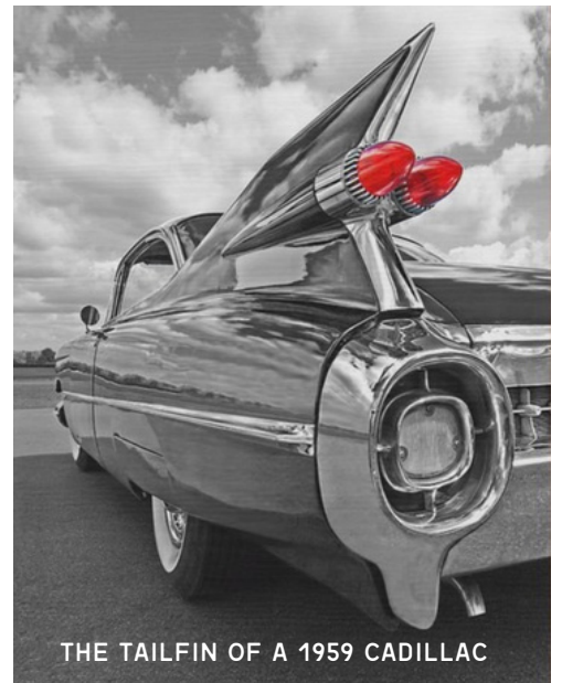
THE TAILFIN OF A 1959 CADILLAC