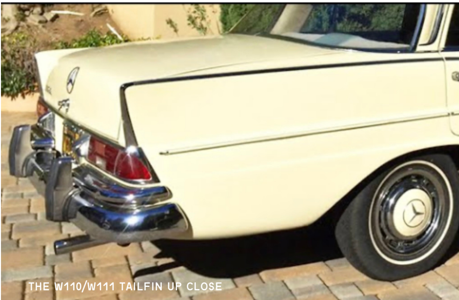
THE W110/W111 TAILFIN UP CLOSE

Design leaders Friedrich Geiger and Paul Bracq had a similar internal struggle, going back and forth on whether the W110 and W111 should even have a tailfin. At first, they agreed on the minimalist tailfin that made it into production. Then they decided against the tailfin but it was too late: the machinery and tooling for sedan production had already been ordered!