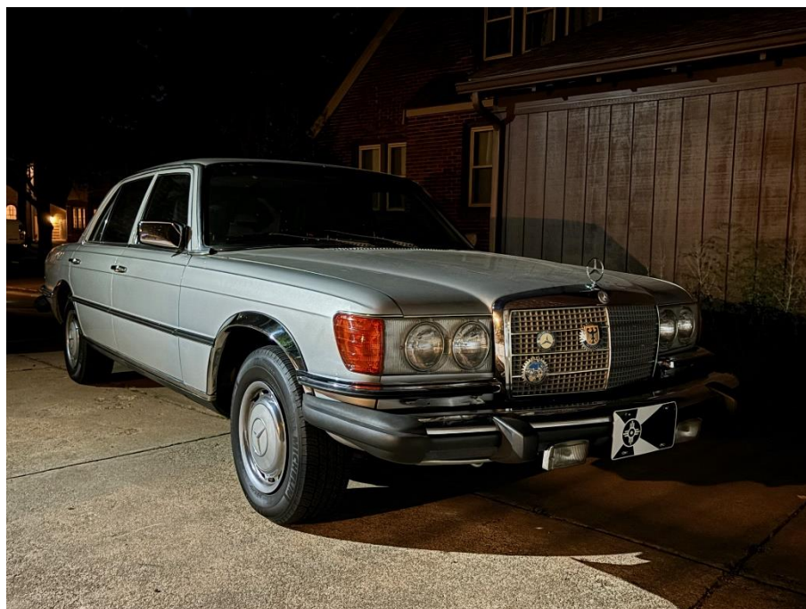
The Valkyrie is back from the shop!

Thank you all for your sustained membership and support of the club!