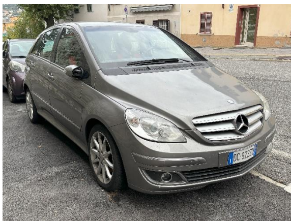
Mercedes B Class