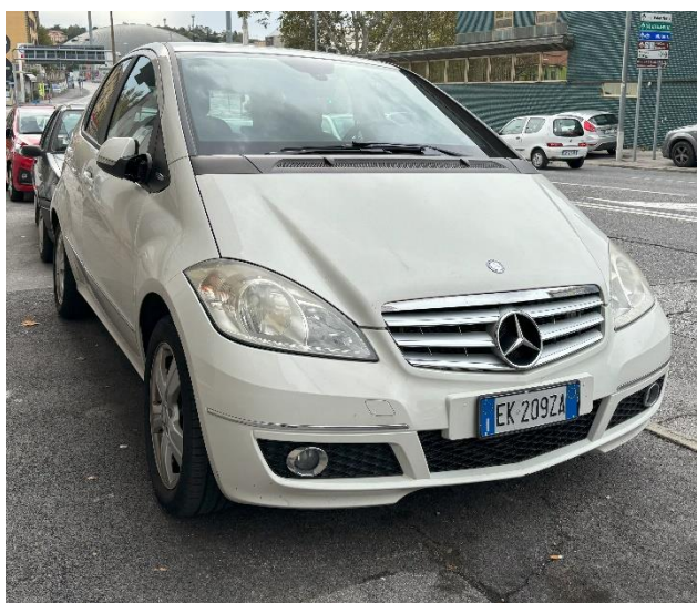
Mercedes A Class