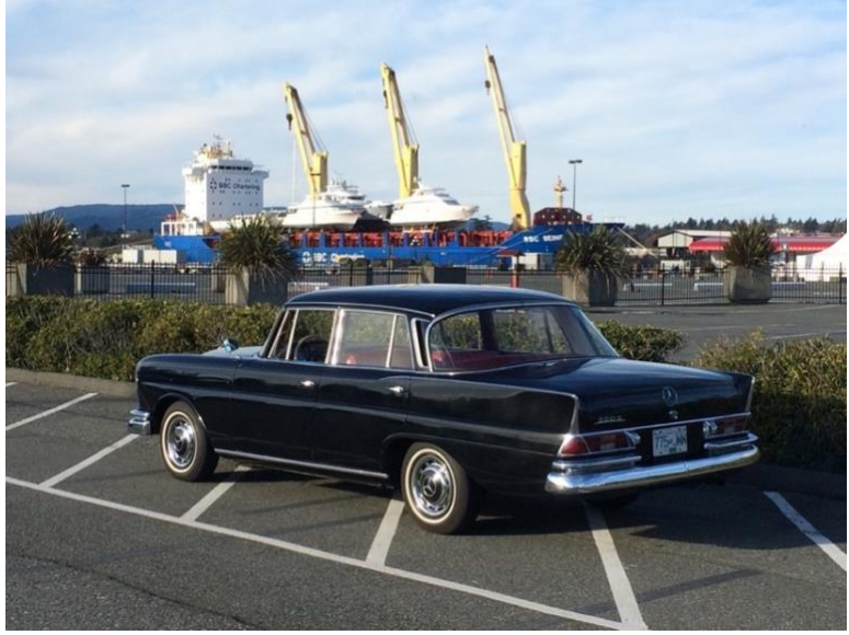
220S at Ogden Point

The best part is driving the car. Solid, responsive, no rattles. These cars were beautifully engineered. And it turns heads. No point in concealing my movements (even if I wanted to). Friends will often say, I see you were at (wherever).