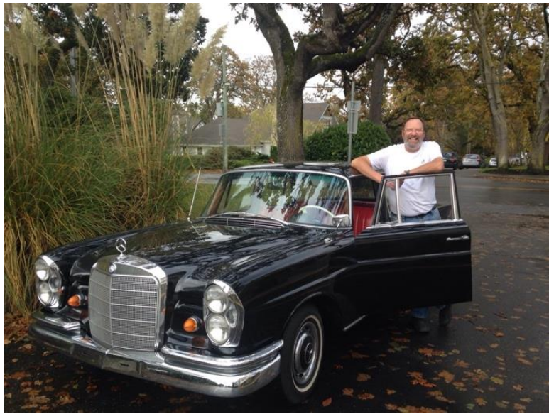
My Car Friend

I'm looking forward to years of happy motoring with Zoom Hilda. And that's the way the Mercedes-Benz!