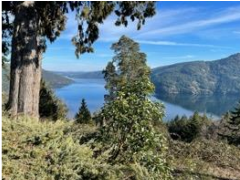
The Saanich Inlet taken from the Malahat Chalet in February 2022

Where: Villa Eyrie Resort, 600 Ebadora lane, Malahat, BC