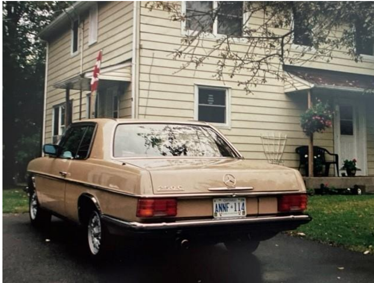
The Mercedes-Benz W114 250C outside the Married Quarter in Ottawa

Mercedes really does cover the waterfront in terms of a vast variety of vehicles. And this has been even more so historically.