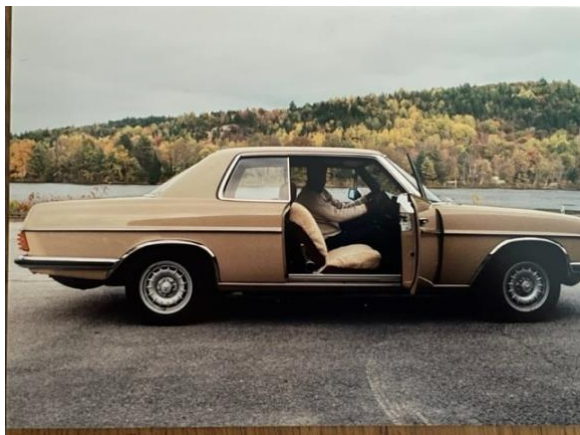
A side view of the 250C

It was certainly a unique vehicle and one day, I noticed a business card was placed under the wiper in a downtown Ottawa parkade where we were living at the time. It was an invitation to consider joining the local section of the Mercedes Benz Club of America which I did.