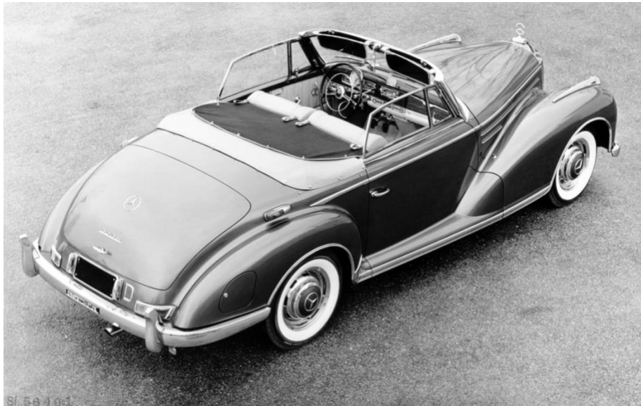
Mercedes-Benz 300 Sc Roadster (W 188), 1955 to 1958. Exterior photo from rear right.