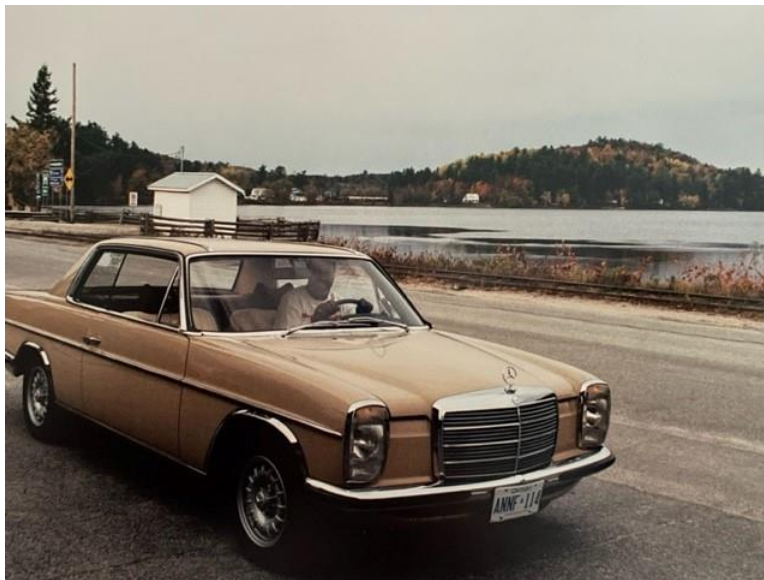
On the move in the Gatineau Hills

Happy motoring and remember, that's how the Mercedes Benz!