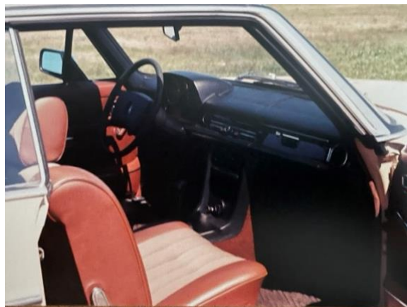
The interior of the 250C