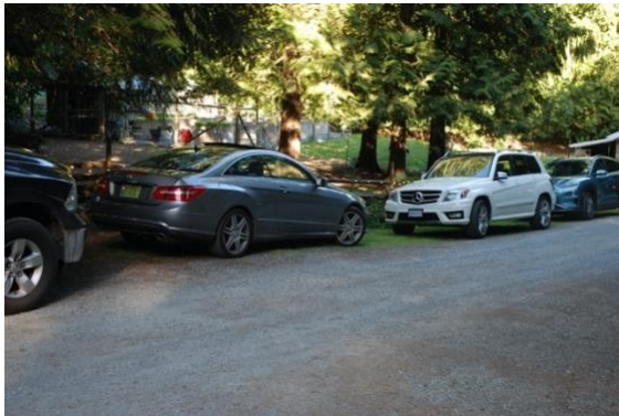
This is a Mercedes-Benz Event. Can you tell?

Our thanks and appreciation go to the well-organized, friendly staff at the Farm Table Inn. They are instrumental in helping make our Summer Solstice Dinner memorable.