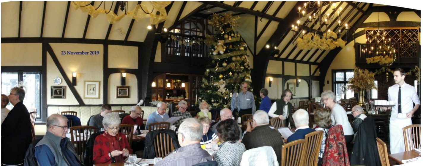
The Holiday and Christmas Lunch at the Fireside Grill in November 2019.