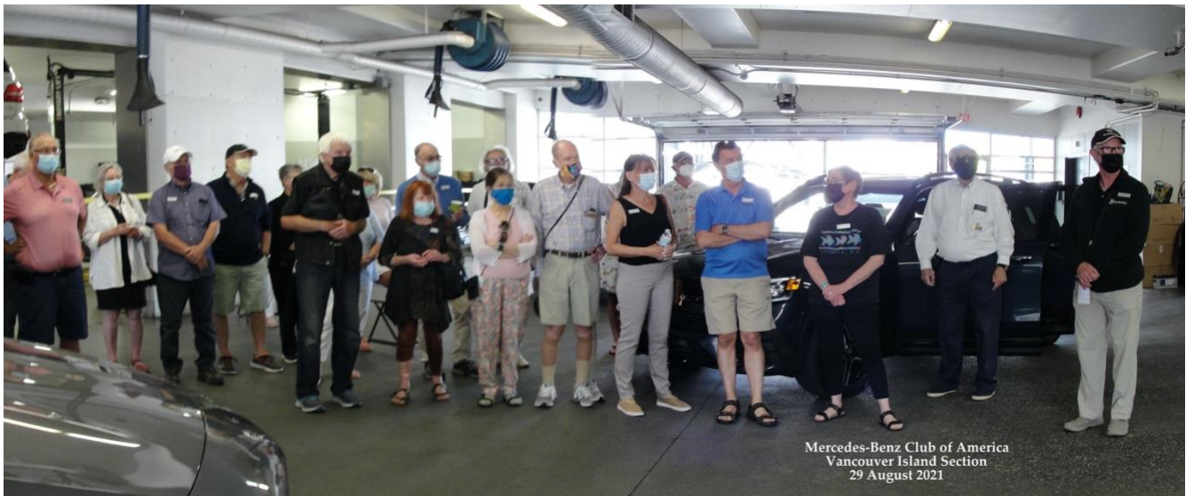
A group of Section members listening intently to details on new cars and technologies in August 2021