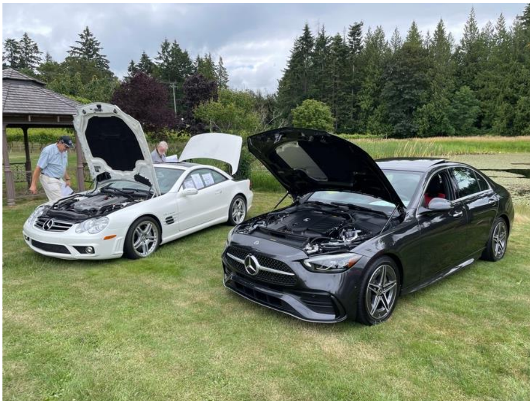
Three Point Motors graciously allowed us the first showing at our Show and Shine of the brand new 2022 Mercedes–Benz C300 4MATIC (foreground).