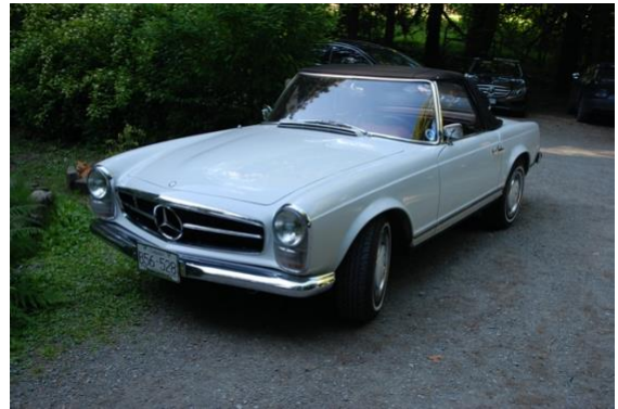
Does this car look familiar?