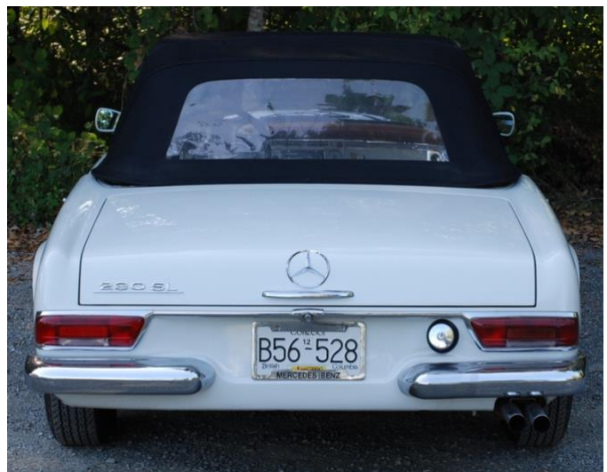
Clockwise from top left. The classic look of the W113. The relative simplicity of an engine from the sixties. What other drivers see of Barry (read the last paragraph of his article). The beautiful combination of red MBTex and white exterior.