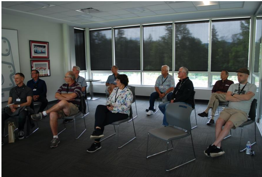
Eager drivers at orientation anticipating what was to come

On Wednesday, June 8, our Section arranged a driving day on the Vancouver Island Motorsport Circuit for nine members plus 3 friends, along with seven observers, including your faithful scribe. The first experience of the day was a talk by the track staff on the driving etiquette to be followed during the initial slalom exercises and the subsequent track speed event.