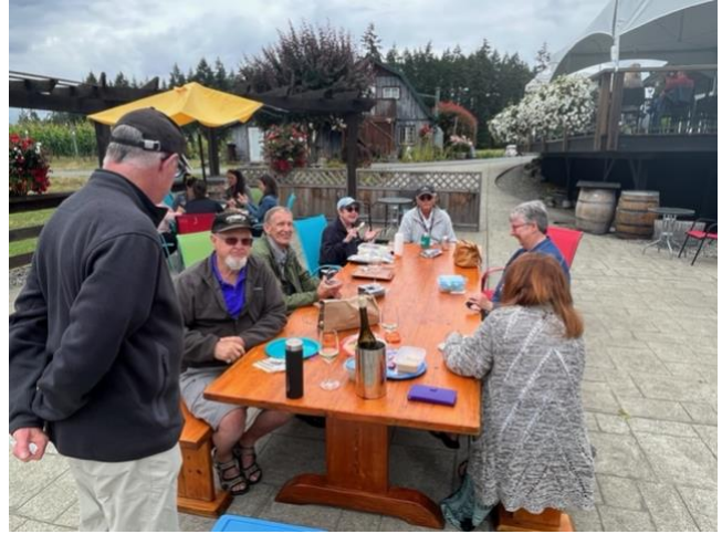
A time for relaxation under a rain-free sky