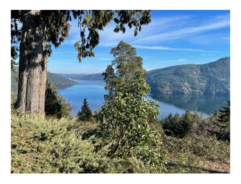
Is it possible that this was February on the Island? We are lucky to live here.

Our small group of 12 were greeted to an unexpectedly warm, sunny day for our Sunday brunch – highly unusual for mid–February. We must have been itching to spread our social wings because we arrived just before 10 a.m. but did not leave until well after noon with over two hours of catching up. Needless to say, we had a good time.