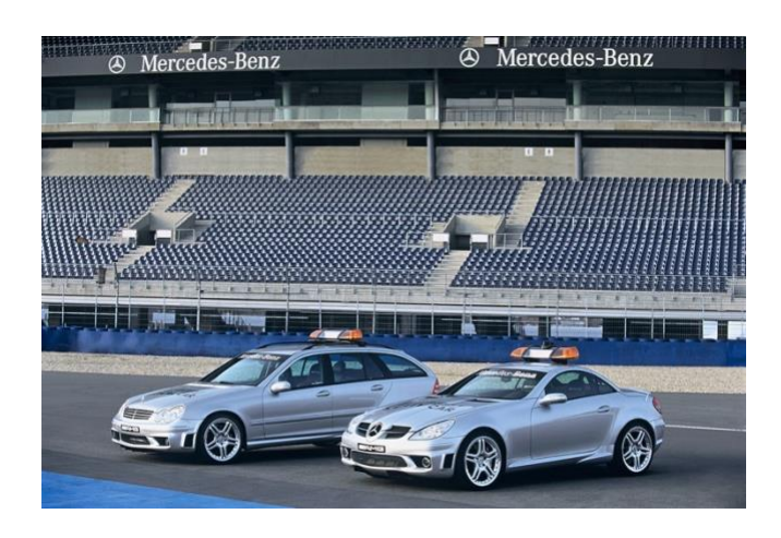
Mercedes-Benz SLK 55 AMG official FIA F1™ safety car (R 171, front, and behind it is the C 55 AMG T-model as the medical car).