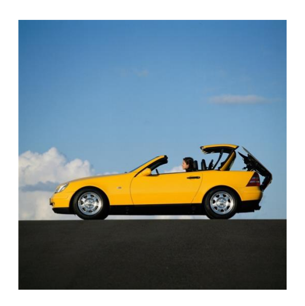
Mercedes-Benz SLK 200 in model series R 170. Exterior photo from left with the folding vario-roof opening.