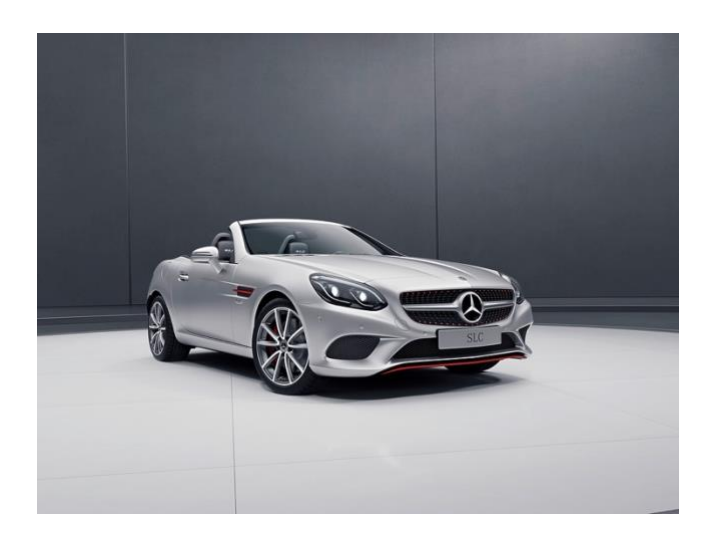
R172 SLC RedArt Edition

So, if you have a hankering for some pleasant, top-down driving in - to quote Sir Jackie Stewart - "a great wee motorcar", look around for a clean, low mileage (under 80,000km) SLK particularly the R170 and R171, as they provide the best value for the money, particularly if you plan to use it as a seasonal car. Just take the time to do the research on what to look out for (e.g., cracked rear subframe on the R171s, particularly in cars from areas where heavy salt is used and the car driven in winter). Also, seek a service history. Do it right and you will have plenty of smiles per mile.