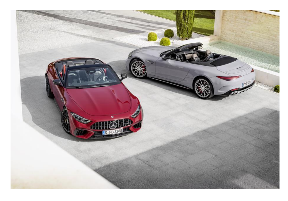
The new R232 SLs.: Mercedes-AMG SL 63 4MATIC and Mercedes-AMG SL 55 4MATIC.