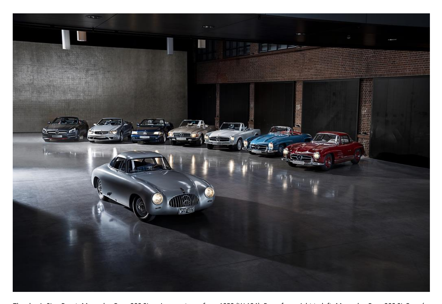
The classic SLs. Front: Mercedes-Benz 300 SL racing sports car from 1952 (W 194). Rear, from right to left: Mercedes-Benz 300 SL Coupé from 1957 (W 198), Mercedes-Benz 300 SL Roadster from 1960 (W 198), Mercedes-Benz 280 SL Pagoda from 1970 (W 113), Mercedes-Benz 350 SL from 1971 (R 107), Mercedes-Benz SL 600 from 1995 (R 129), Mercedes-Benz SL 55 AMG from 2005 (R 230), Mercedes-Benz SL 500 Special Edition "Mille Miglia 417" from 2015 (R 231).