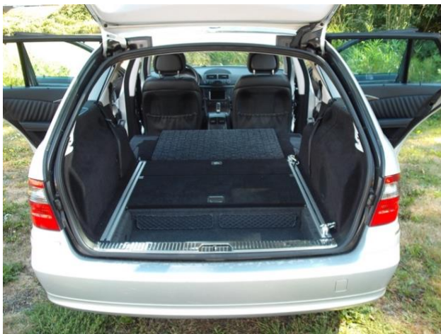
Transforming. Flatbed and rear well

A Transformer: Depending on bits one leaves in or takes out; what's turned on or off; the transmission setting; and the disks in the CD player, this is (1) a Great Touring Car, (2) a Luxury 4/5 passenger Sedan, (3) a 7 passenger Limousine, (4) a Camper, (5) a Moving Van, (6) a Cargo Flatbed, (7) Animal Transport, and (8) dare I say it, a Sports Car.