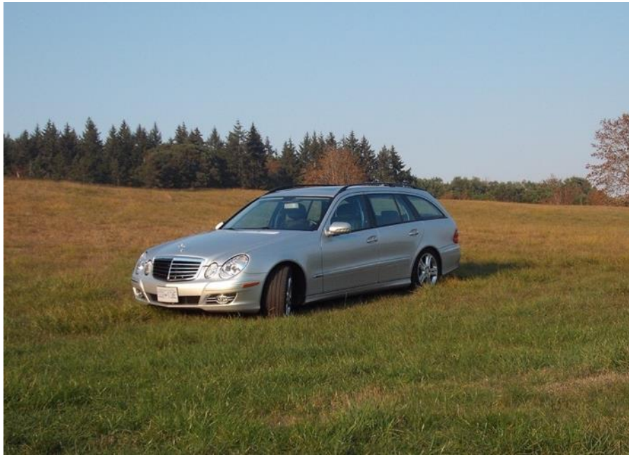
My princess – outstanding in her field

Brunhilda: A beautiful Amazon-like princess in Germanic heroic legend. Princess: Requiring a lot of attention, not to mention money, (like a hobby).