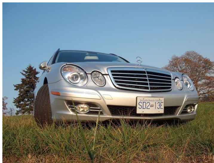
Always ready to play

Performance: A delight to drive at any time. Quiet, smooth, and relaxing. She handles our interestingly twisty country roads extremely well. And on the straight bits she’s as solid as a rock at 203 km/h, ( but that’s another story ). With the Rock & Roll cranked right up (“ Only Yooooou ... ”), or the Philharmonic at full blow, it’s just like sitting comfortably in a Concert Hall while hurtling through the Universe.