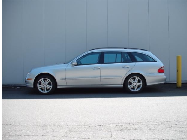
Photogenic, eh? Waiting at Wal-Mart

The 211 chassis is considered to be the best and most reliable E-Class built since the W124 (1986-1995) of almost 30 years ago. And its elegant and timeless design make it the only car I have ever had that people stop to say “that’s the most beautiful car I have ever seen”, or more simply that it’s “beautiful”, and often ask if it’s a new one.