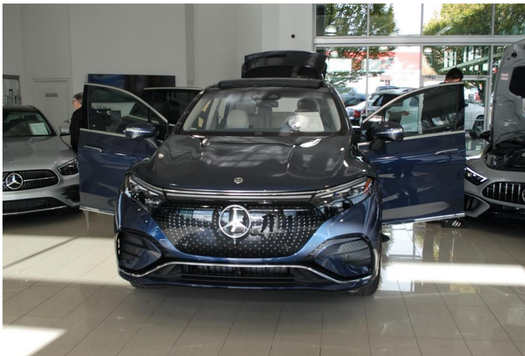
The new EQS SUV.