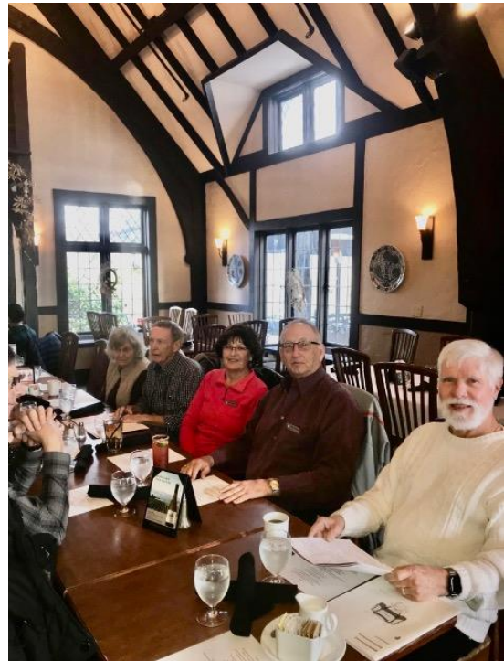
Enjoying our lunch and looking forward to the Holidays and Christmas