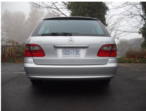
Modest skirts, (no pipes)

At the Oak Bay car show this past Summer, while showing off her “flatbed”, Brunhilda got quite a bit of attention, and received two offers: One from a chap wanting to trundle around his dog pack; and another who very seriously wanted her as a camper.