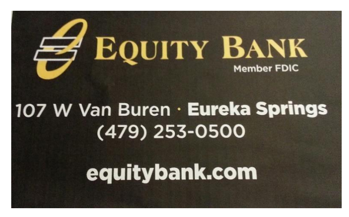
Ozark Section Supporter Since 2015