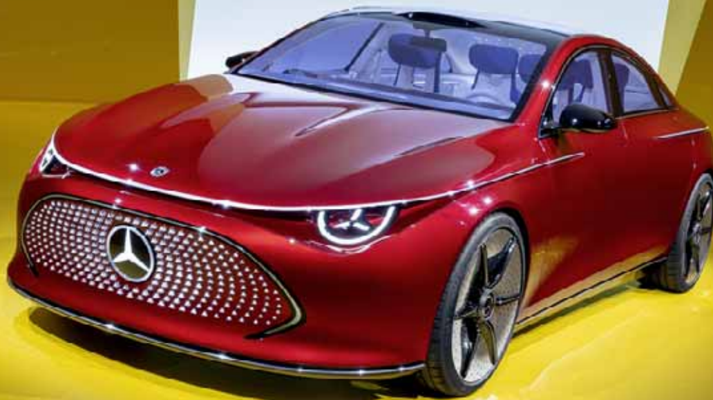
A LARGE NUMBER OF LEDS ON THE GRILL OF THE CLA CONCEPT CAR ADDS TO ITS UNIQUE EXTERIOR DESIGN.