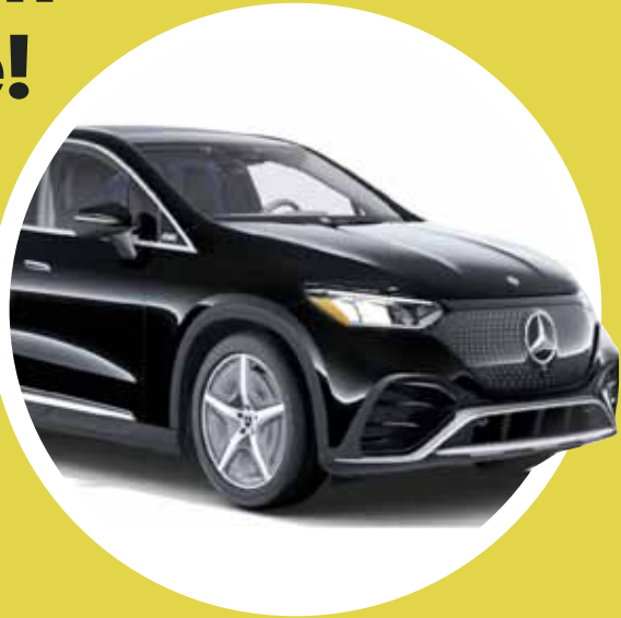
2024 AMG GLE53 4matic+ SUV (or choose equivalent cash)