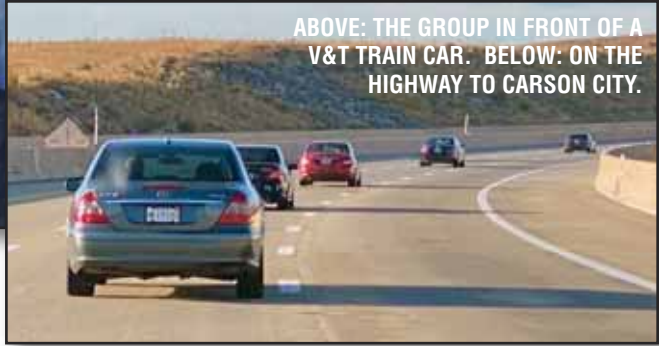
ABOVE: THE GROUP IN FRONT OF A V&T TRAIN CAR. BELOW: ON THE HIGHWAY TO CARSON CITY.