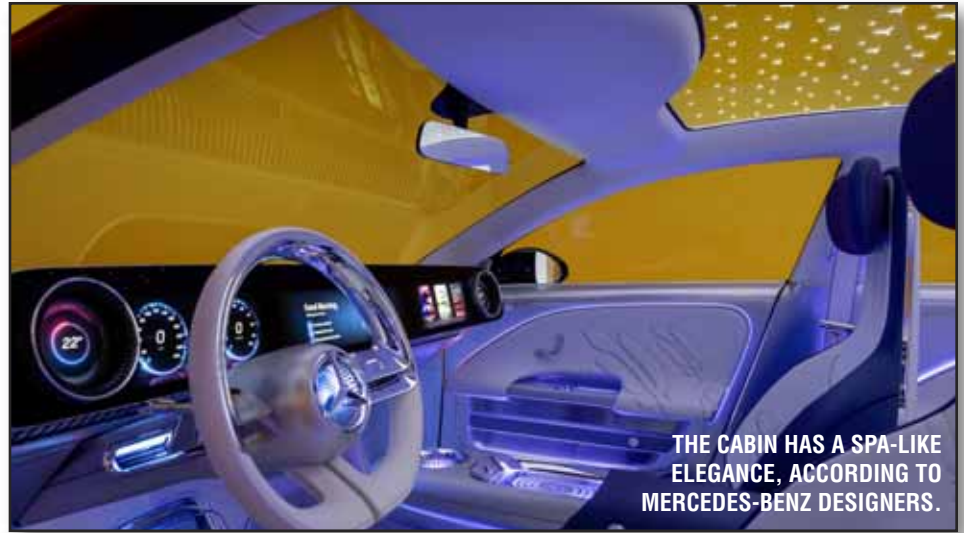
THE CABIN HAS A SPA-LIKE ELEGANCE, ACCORDING TO MERCEDES-BENZ DESIGNERS.

The car’s output flows through a two-speed transmission that enables better efficiency over a wider range of