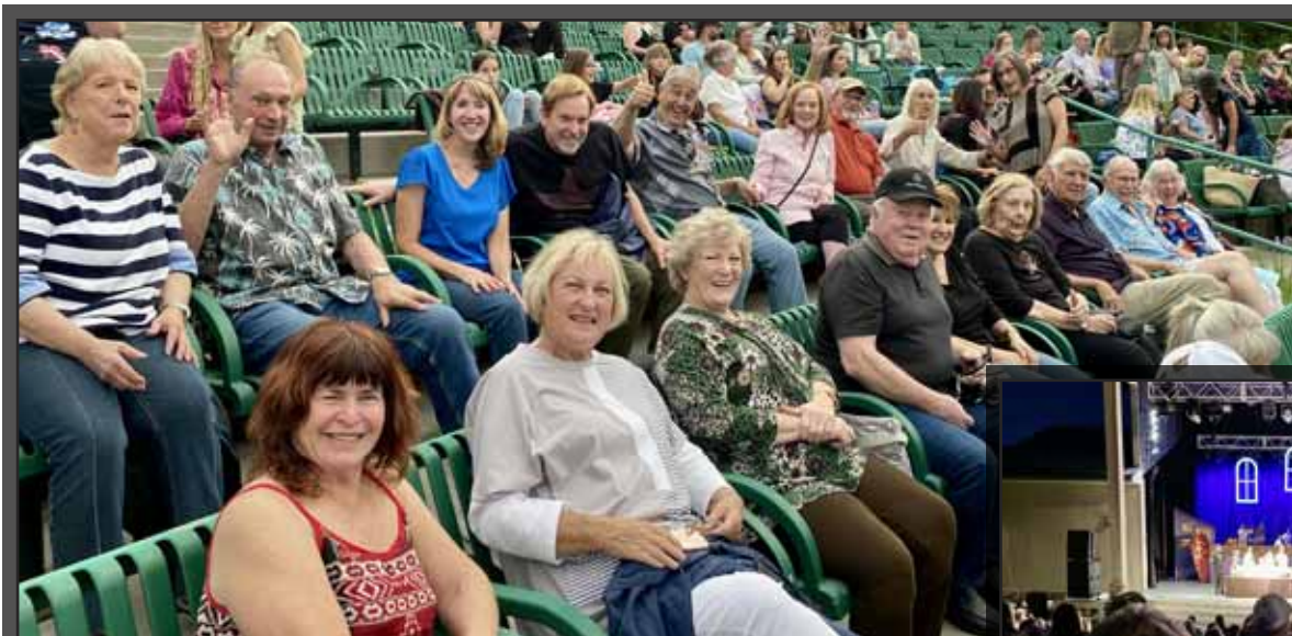
CLUB MEMBERS ENJOYED A BEAUTIFUL EVENING WITH MODERATE TEMPERATURES, PERFECT FOR AN OUTDOOR PLAY.