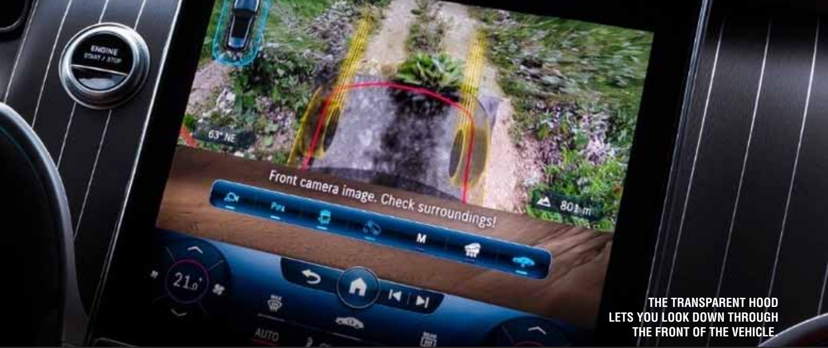
THE TRANSPARENT HOOD LETS YOU LOOK DOWN THROUGH THE FRONT OF THE VEHICLE.