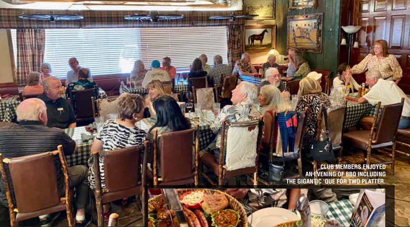
CLUB MEMBERS ENJOYED AN EVENING OF BBQ INCLUDING THE GIGANTIC 'QUE FOR TWO PLATTER.