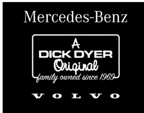
Thanks for sponsoring our EV Event in Columbia, SC

In the afternoon, we took a ride to downtown Columbia to take a guided tour of the SC State House. Our tour guide presented the history of how Columbia became the location of the state capital. The guide also talked about the buildings of the past and current state