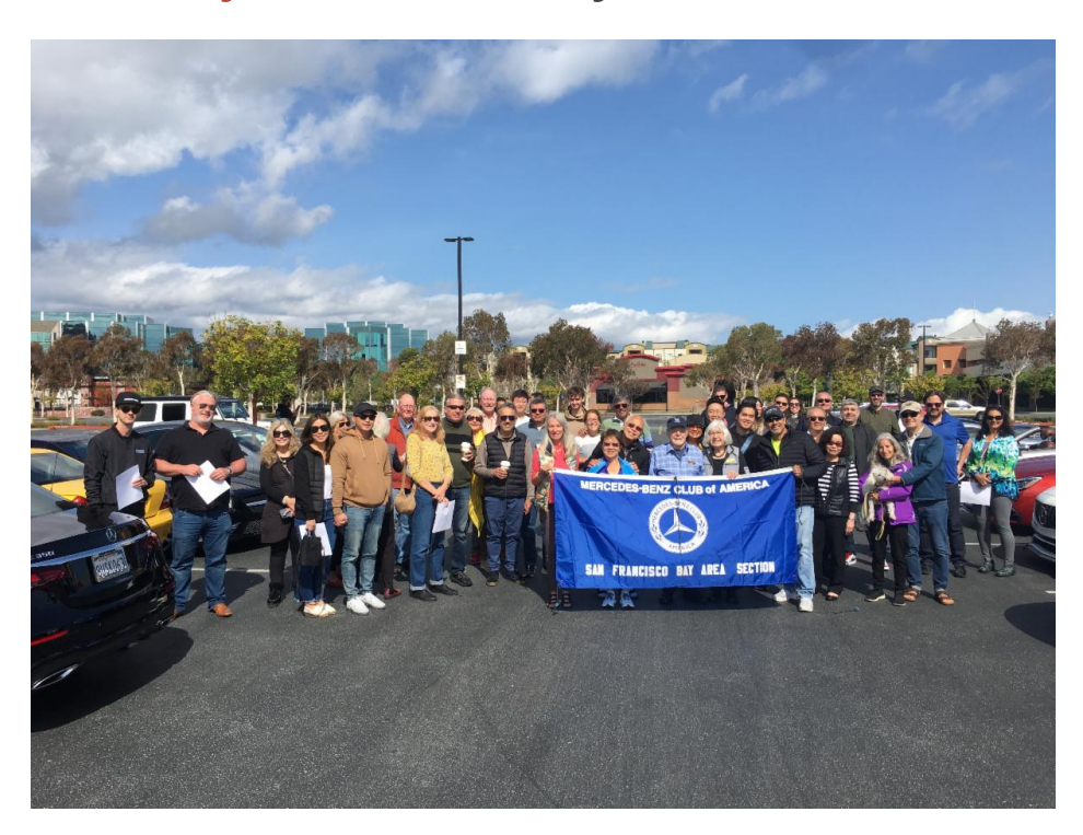
On a beautiful sunny day the SFBA-MB Club held the First Sunday Drive of May, which was super-subscribed with 40 vehicles and 40