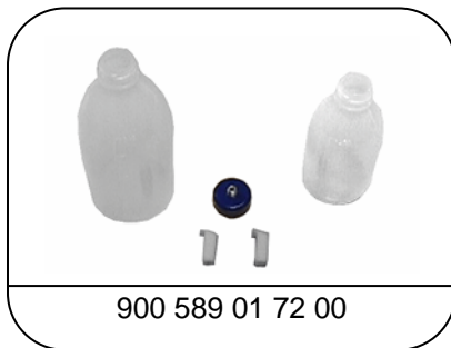
Wax Application Kit 1)