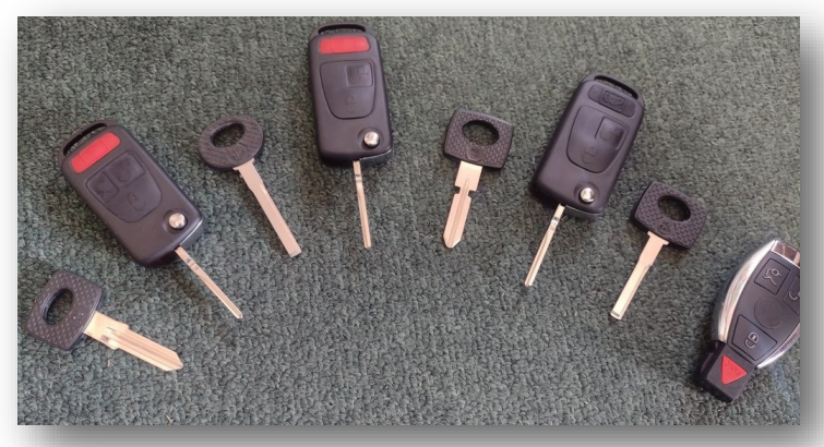
2936 Southwestern Blvd.