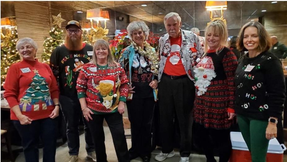
Ugly Christmas Sweater Contest