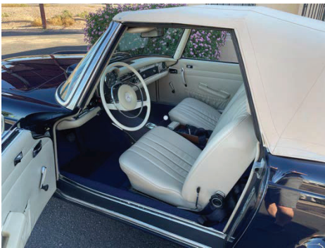
SL interior and top that was at the Vegas Sema show this year

Top Shop can be reached at 602-277-6949, or email them at tapper20@hotmail.com . Be sure to check them out on the web at http://aztopshop.com , or alternately on Facebook or Yelp!