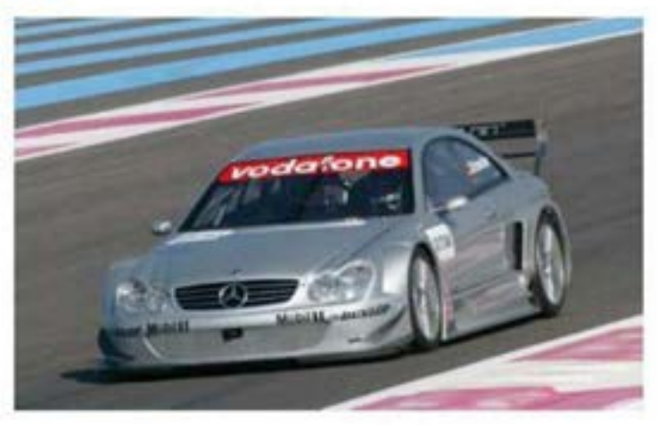
MEMBER OF THE MERCEDES-BENZ, BMW, PORSCHE, AUDI, & FERRARI CLUBS OF AMERICA