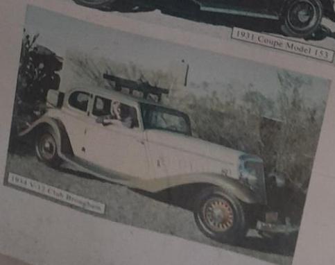
1934 V-12 Club Brookton