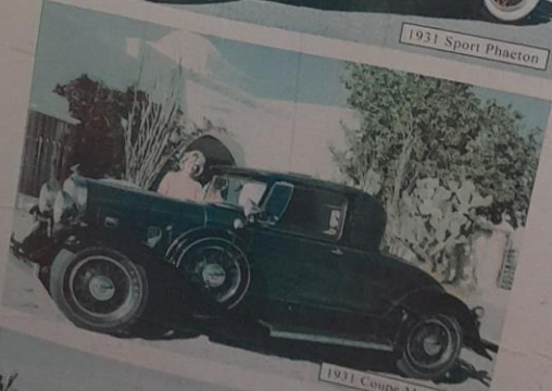
1931 Coupe Model 153