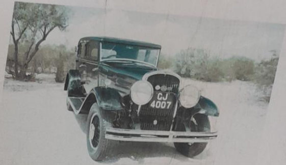
1930 Deauville Sedan

Telephone: 520-526-6026 • Email: franklinmuseum@aol.com • Internet: www.franklinmuseum.org