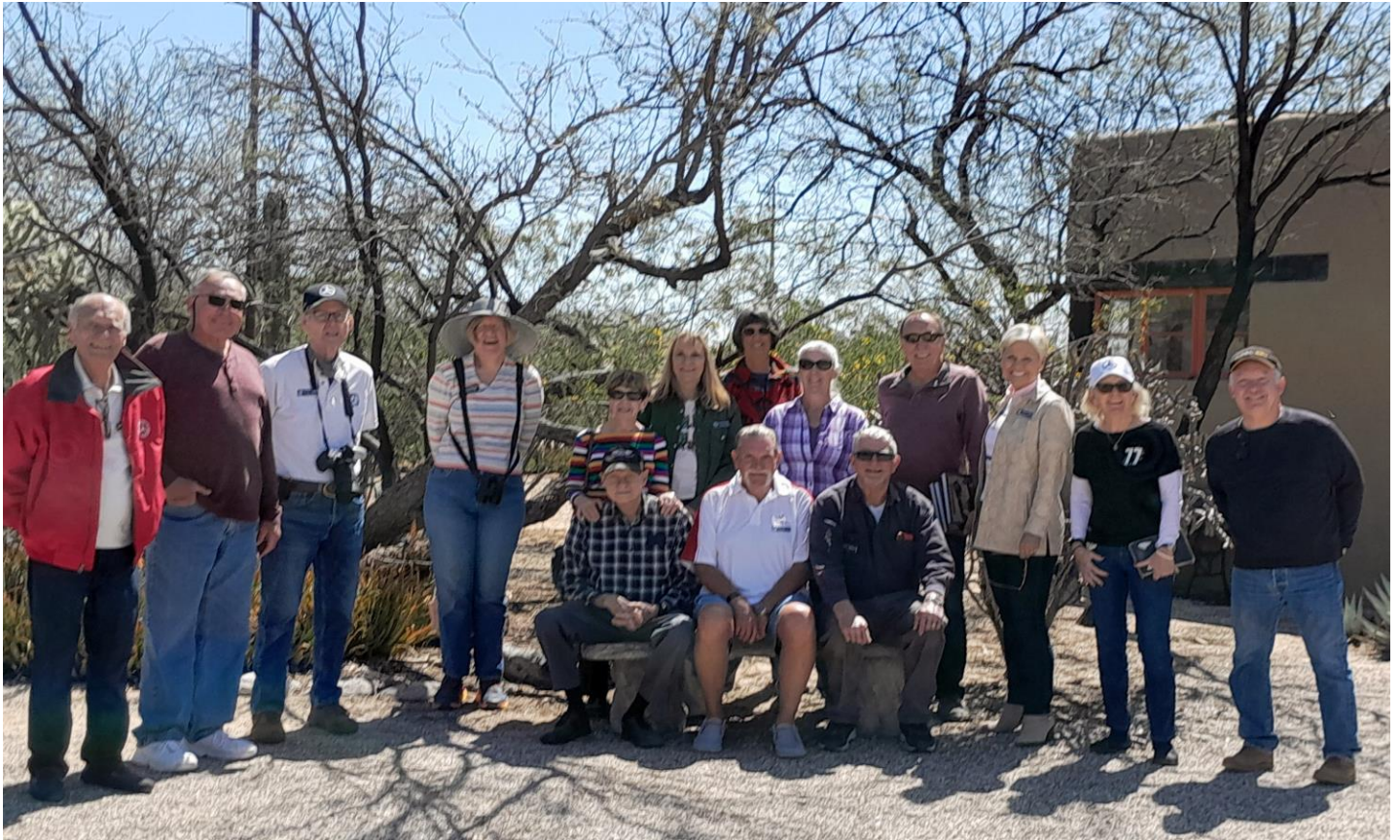
Chaparral Section Group Picture for Franklin Auto Museum Tour