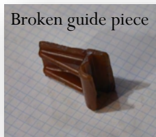
Broken guide piece