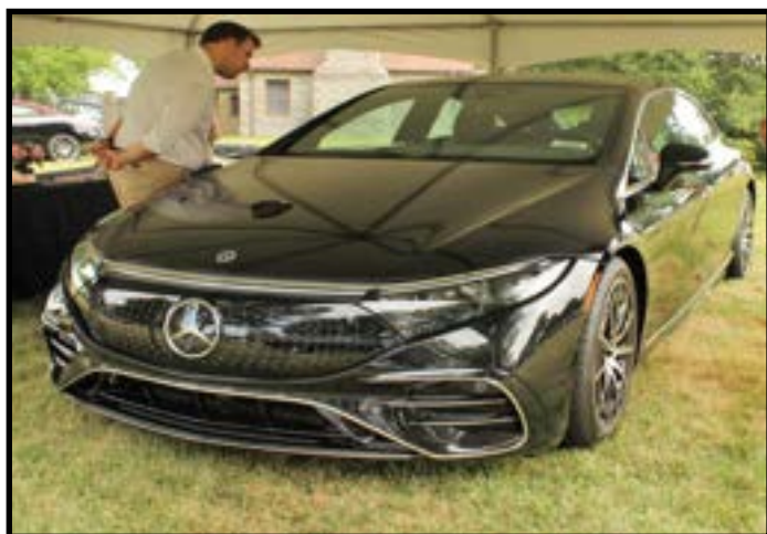
James Motors of Lexington had the EQ Sedan on display at the Concours d’Elegance at Keeneland in July 2022.

Watch for more information coming soon. And, stay up to date about all the exciting Mercedes EQ vehicles and the lifestyle of electric mobility by signing up to get “Charged,” the exclusive newsletter for Mercedes EQ at mbusa.com