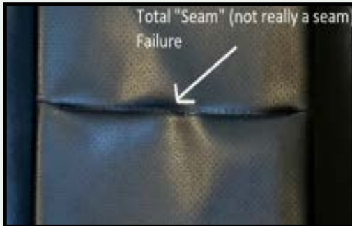
Fake "seam" failure

A well-known problem for 2010's E and C class cars with MB-TEX or leather interiors is the split seam in the middle of the lower seat cushion. It isn't really a seam but a sewed joining of the seat cover and the pockets for the seat heaters. The holes from sewing weaken the fabric, and eventually it splits. Mine did this at about 30K miles! And I am certainly not of a weight that would have put any strain on it...:)