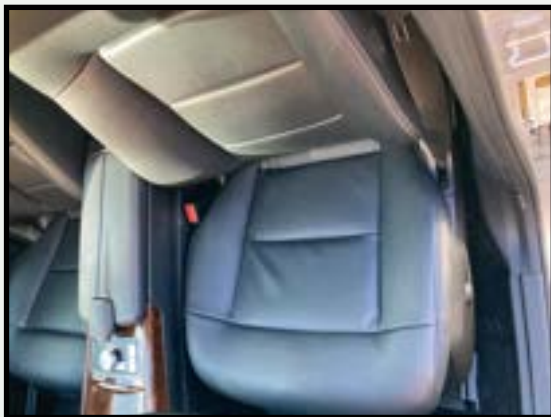
Replaced Seat Cover (Small wrinkles are probably from sitting on it in the cold.).

Compared to replacing the seat skins on my 1980's SL's, this is very simple and almost tool-free, requiring no removal of the entire seat. Note that the technician in the video is doing this on a European car, and it doesn't have the "cubby" that a US E class seat would have. Removing that piece at the front of the cushion is simple. The material match was excellent in grain, color, and feel.